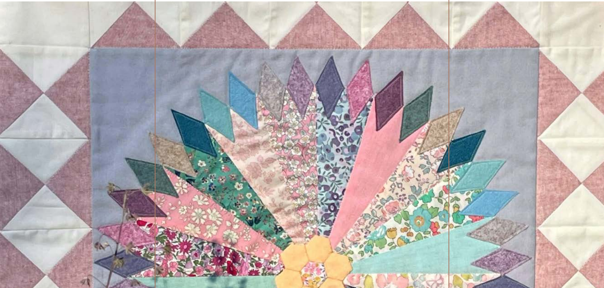
BRONTË SISTERS' QUILT